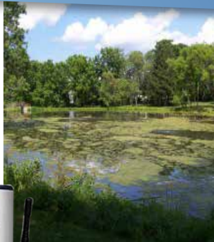
Safe for fish & plants