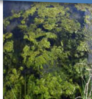
Suitable for large dams